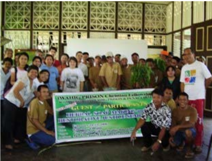
[Training participants in Iwahig, Palawan]