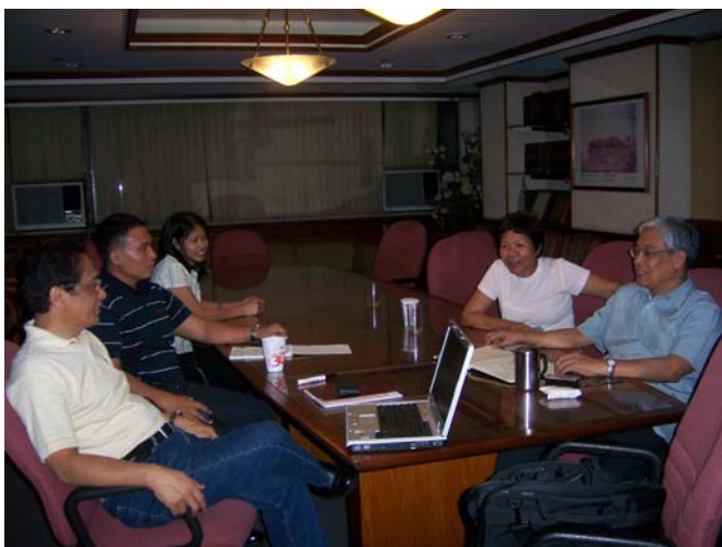
[NPMP strategic planning meeting]

ephesiansway@yahoo.com tessuadan@yahoo.com